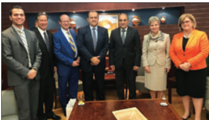
AHI Delegation with Mr. Demetris Syllouris, Speaker of the Cypriot House of Representatives.

The AHI delegation received multiple briefings from Cypriot and American officials on the status of settlement talks for Cyprus under UN auspices; Cyprus’ efforts to explore for hydrocarbon reserves in its exclusive economic zone (EEZ), and on Cypriot commerce and tourism sectors. In addition, there were discussions about raising awareness in the United States of the Missing Cypriots issue. All throughout the delegation’s meetings in Cyprus, AHI was commended for its past advocacy and current steadfast efforts to keep the Cyprus issue highly visible with key policymakers in the Obama administration and in the U.S. Congress.