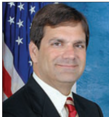
U.S. Representative Gus M. Bilirakis.

U.S. Representative Gus M. Bilirakis (R-FL), co-chair, Congressional Caucus on Hellenic Issues, and co-chair, Congressional Hellenic Israeli Alliance, spearheaded a letter to the Trump administration demanding justice for the Americans attacked by Turkish President Tayyip Erdogan's security detail. The letter, co-authored by House Foreign Affairs Chairman