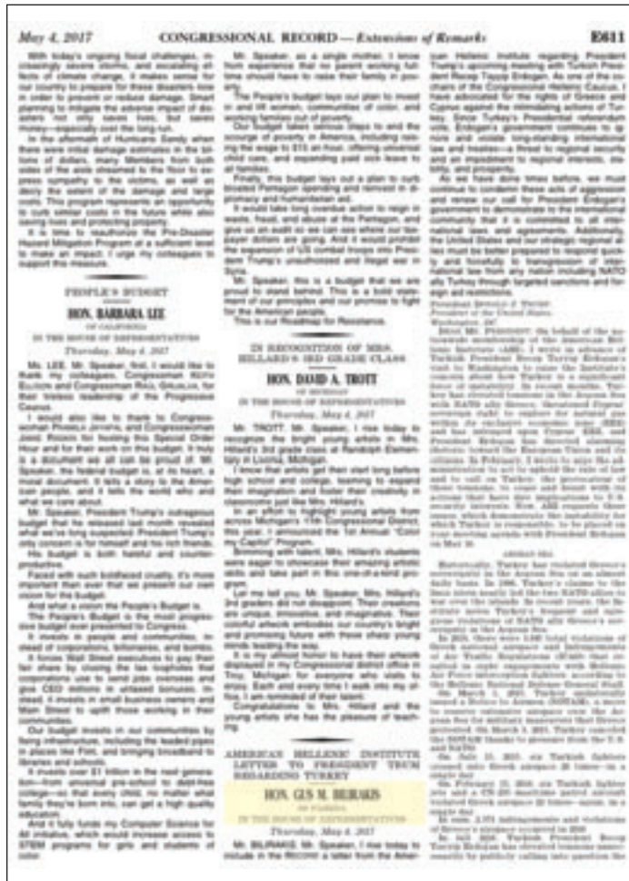
Rep. Bilirakis' Congressional Record Entry of AHI's letter to President Trump.