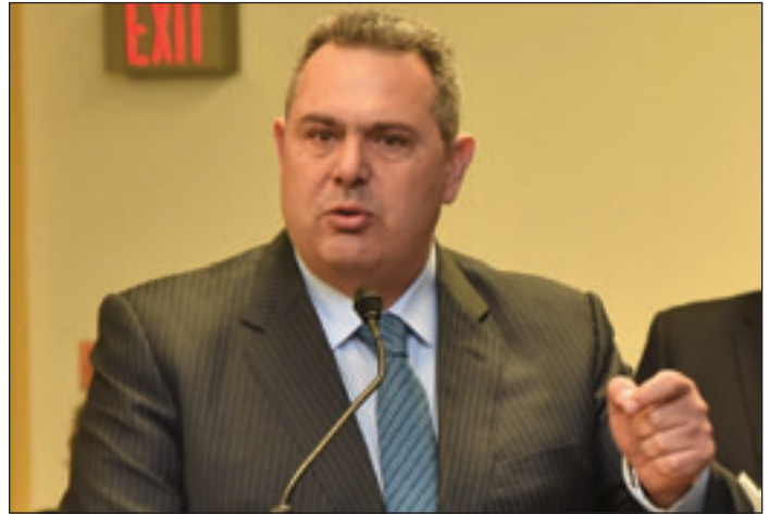
Minister of Defense of Greece Panos Kammenos.