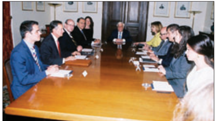
AHI Delegation briefing with President Pavlopoulos and staff.

Extensive briefings with foreign and defense ministry officials, and two AHI presentations in Athens, were highlights of the delegation’s itinerary in Greece from May 11 to 18, 2017. The itinerary also included the 13th Annual AHI Athens Hellenic Heritage Achievement and Public Service Awards Dinner at the Grand Bretagne Hotel, May 17, which drew a record number of attendees at more than 400 persons.