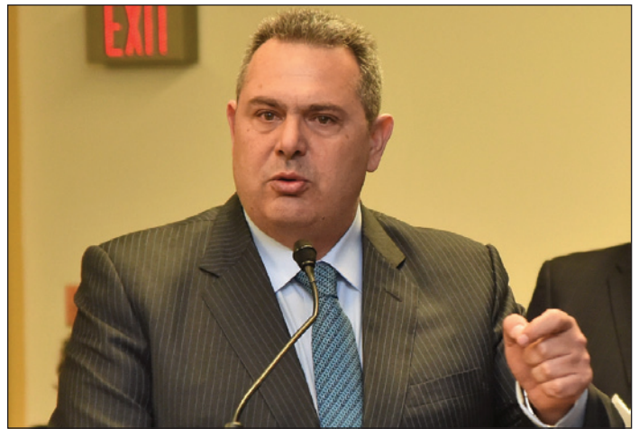
Minister of Defense of Greece Panos Kammenos.