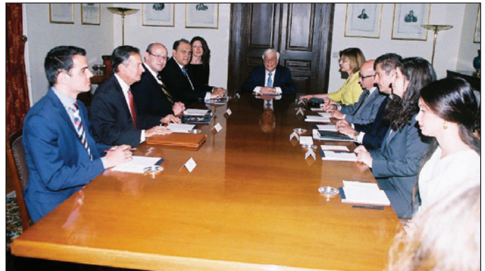
AHI Delegation briefing with President Pavlopoulos and staff.

Extensive briefings with foreign and defense ministry officials, and two AHI presentations in Athens, were highlights of the delegation’s itinerary in Greece from May 11 to 18, 2017. The itinerary also included the 13th Annual AHI Athens Hellenic Heritage Achievement and Public Service Awards Dinner at the Grand Bretagne Hotel, May 17, which drew a record number of attendees at more than 400 persons.