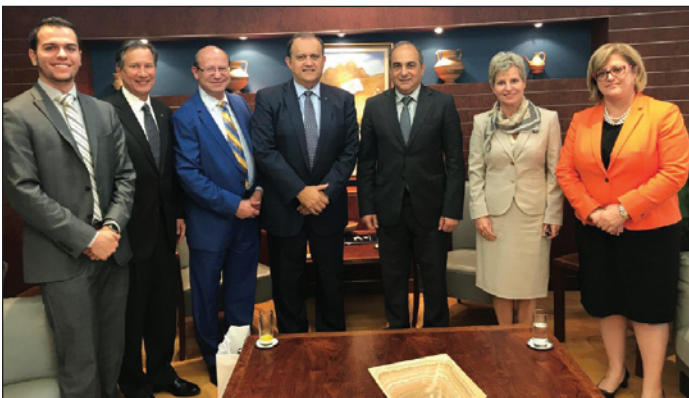
AHI Delegation with Mr. Demetris Syllouris, Speaker of the Cypriot House of Representatives.

The AHI delegation received multiple briefings from Cypriot and American officials on the status of settlement talks for Cyprus under UN auspices; Cyprus’ efforts to explore for hydrocarbon reserves in its exclusive economic zone (EEZ), and on Cypriot commerce and tourism sectors. In addition, there were discussions about raising awareness in the United States of the Missing Cypriots issue. All throughout the delegation’s meetings in Cyprus, AHI was commended for its past advocacy and current steadfast efforts to keep the Cyprus issue highly visible with key policymakers in the Obama administration and in the U.S. Congress.