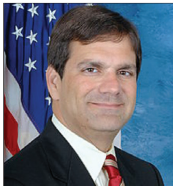
U.S. Representative Gus M. Bilirakis.

U.S. Representative Gus M. Bilirakis (R-FL), co-chair, Congressional Caucus on Hellenic Issues, and co-chair, Congressional Hellenic Israeli Alliance, spearheaded a letter to the Trump administration demanding justice for the Americans attacked by Turkish President Tayyip Erdogan's security detail. The letter, co-authored by House Foreign Affairs Chairman