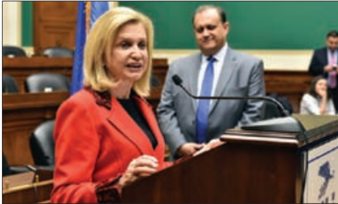
Rep. Carolyn Maloney.

AHI celebrated the 195th anniversary of Greek Independence Day by hosting its annual “Congressional Salute to Greek Independence Day,” on April 13, 2016. The common democratic ideals held by Greece and the United States were reaffirmed by several members of Congress at the event which was held in cooperation with the co-chairs of the Congressional Caucus on Hellenic Issues, U.S. Reps. Gus Bilirakis (R-FL) and Carolyn Maloney (D-NY).