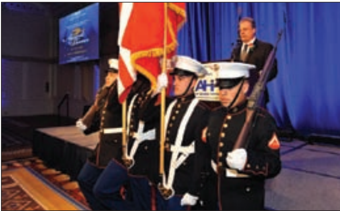
Presentation of the colors by the United States Marine Corps.