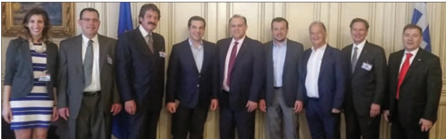
The AHI delegation with Prime Minister of Greece Tsipras.

to Greece, noting a strong U.S.-Greece relationship and the generosity of the Greek people and the Greek American community, “After three years, I can happily say that our relationship as defense allies and friends is as strong as ever. Greece needs allies, and friends, now, perhaps more than ever. I have seen how the Greek people have suffered under the tremendous weight of the economic crisis and the migrant crisis. But, when I see the remarkable generosity of Greeks and Greek-Americans, helping their neighbors and total strangers through this time of crisis, I feel optimistic about the future of Greece. It is a true testament to the generosity of spirit, the natural ‘philotimo’, which exists both here in Greece and among the diaspora community.”