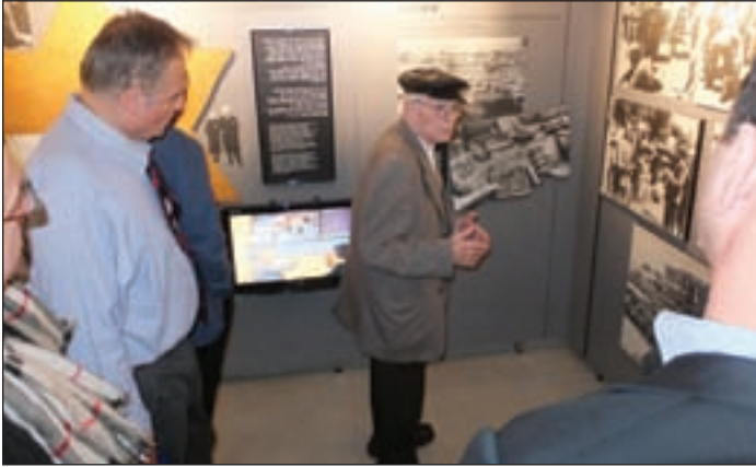
A Holocaust survivor from Thessaloniki providing a tour at the Greece Jewry Heritage Center.