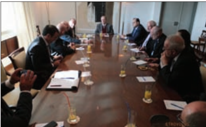
Foreign Minister Ioannis Kasoulidis briefing the group.

and military officials—in addition to local community leaders—from the three countries and the United States. The Mission also visited military installations at Palmachim Air Base, Yavne, Israel and Souda Bay, Crete, Greece. The participating organizations included: American Hellenic Educational Progressive Association (AHEPA), American Hellenic Institute (AHI), B'nai B'rith International, and the Conference of Presidents of Major American Jewish Organizations.