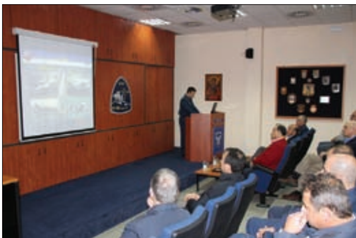
Briefing at the 115CW F-16 Fighter Squadron in Souda Bay, Crete.