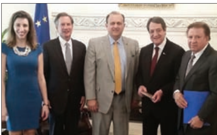
The AHI delegation with President of the Republic of Cyprus Anastasiades.