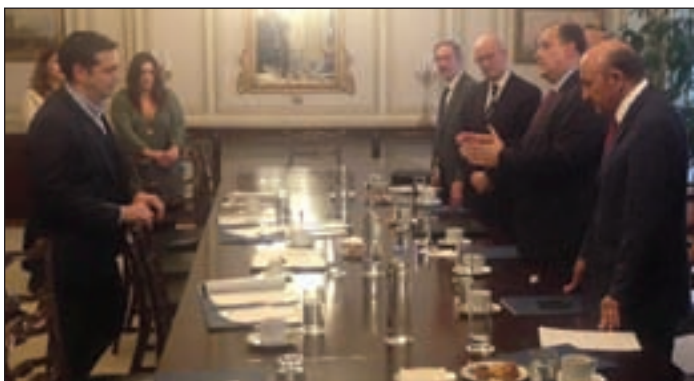
Prime Minister Tsipras briefing the delegation.