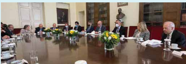
Briefing with Greek Minister of Foreign Affairs, Nikos Dendias