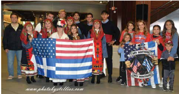
The St. Demetrios Greek Orthodox Church dancers of Upper Darby, PA pictured during the pre-game festivities