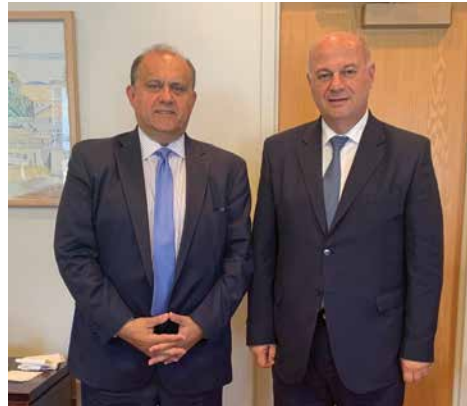
(L-R) Nick Larigakis with Greek Minister of Justice Konstantinos Tsiasaras

Larigakis met with Alternate Minister of Foreign Affairs of Greece Miltiades Varvitsiotis on the sidelines of the 3rd Southeast Europe & Eastern Med Conference in Washington, D.C., March 14.