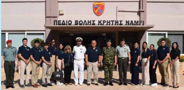
Visiting and receiving a briefing by commanders at the NATO Missile Firing Installation (NAMFI) in Crete.