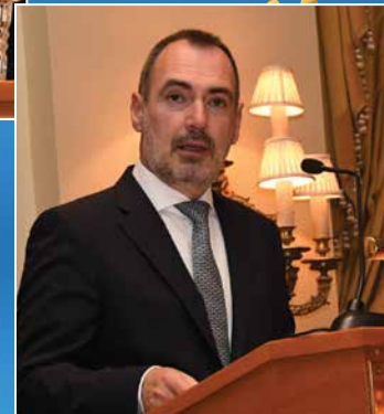
Representing the Prime Minister, Deputy Foreign Minister Andreas Katsaniotes, offering greetings.