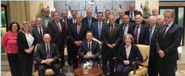
Delegation with the President of Israel, Isaac Herzog.

A 19-member delegation of leaders of American Hellenic and American Jewish organizations completed a fifth, three-country Leadership Mission to Greece, Cyprus and Israel, to explore the major political, economic and security developments underway in the eastern Mediterranean and to advance the interests of the U.S. in the region. Meetings were held with more than 30 high-ranking government officials, military officers, and policy analysts from the three countries and the United States between April 26 and May 4. The participating organizations included: AHI, the Order of AHEPA, B'nai B'rith International, and Conference of Presidents of Major American Jewish Organizations.