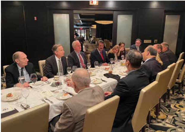
AHI Board members with Senator Chris Van Hollen