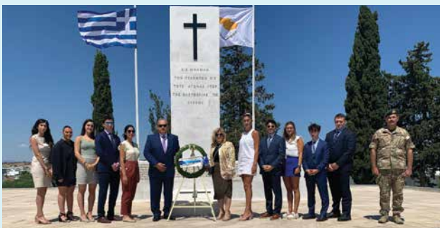
The students paying their respects to the fallen by laying a wreath at the military cemetery and war memorial at the Makedonitissa Tomb.