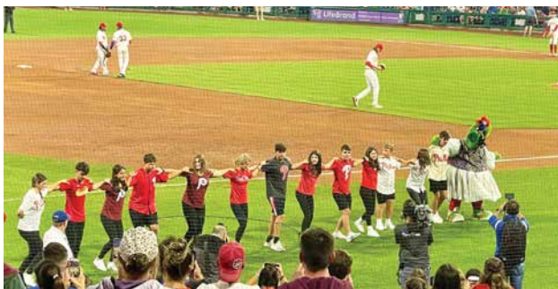
The dance troupe of St. George Greek Orthodox Church of Media, PA dancing with the Phillie Phanatic in Evzone costume