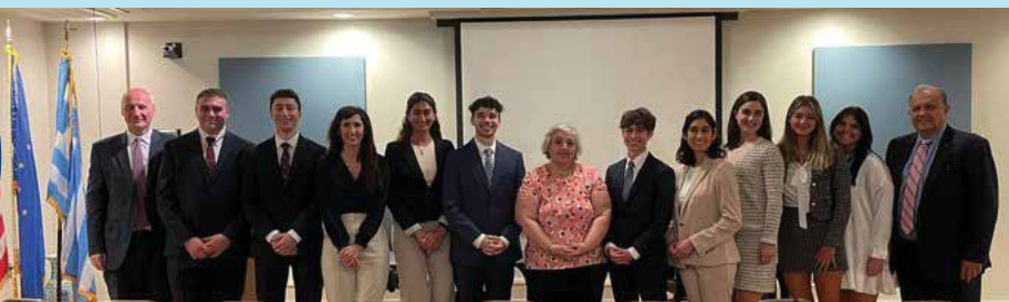
Students pictured with Ambassador Papadopoulou