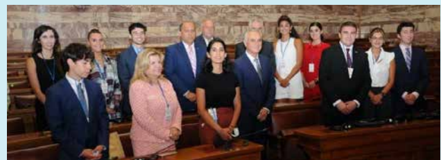
Meeting with Special Permanent Committee of Diaspora Greeks Chairman Savvas Anastasiadis and members of the Standing Committee on National Defense and Foreign Affairs