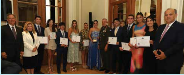
The AHIF students receiving certificates of participation at the farewell dinner.