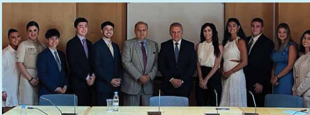
Meeting with Presidential Commissioner Mr. Photis Photiou at the Ministry of Foreign Affairs