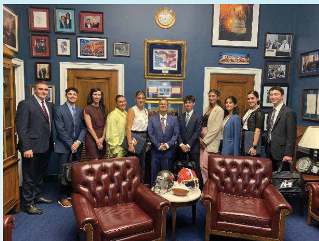
Students pictured with Rep. Gus Bilirakis (R-FL)