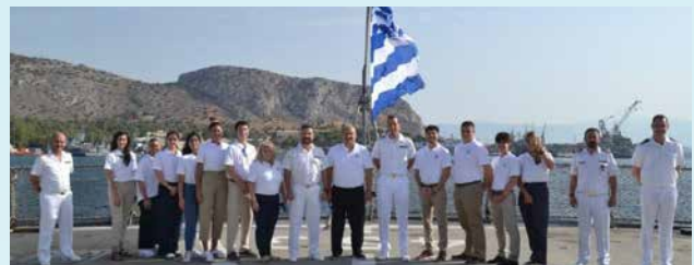
Students aboard the frigate "SPETSES" at Salmis Naval Base.