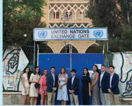
The students in front of the Ledra Palace Hotel