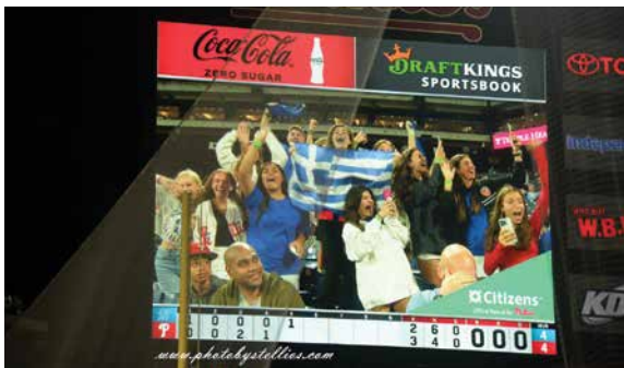
Greek-American fans shown on the stadium's jumbo-tron

AHI annual Greek Heritage Night, held in cooperation with Major League Baseball's Philadelphia Phillies, made its triumphant return—with the popular Phillies mascot, The Phillie Phanatic, sporting an Evzone costume, and all—at Citizens Bank Park, Philadelphia, Pa., September 7, 2022. Approximately 600 tickets were sold for the 7th annual event which featured the Philadelphia Phillies versus the Miami Marlins.