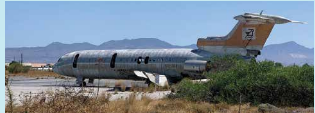
Students visited an abandoned Cyprus Airways plane which lies on the tarmac at the UN controlled Nicosia Airport