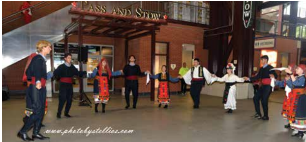
The St. Demetrios Greek Orthodox Church dancers of Upper Darby, PA performing traditional Greek dances before the game