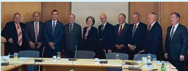
Delegation with the Foreign Minister of Cyprus Ioannis Kasoulides.

“Our meetings clearly affirmed the trilateral partnership between Israel, Cyprus, and Greece is strong and vibrant and is well-positioned to sustain that course. Together with the United States, the 3+1 framework is committed to achieving peace, stability, and prosperity in the eastern Mediterranean