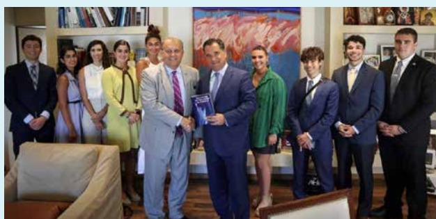
The students with Minister of Development and Investment Adonis Georgiadis.