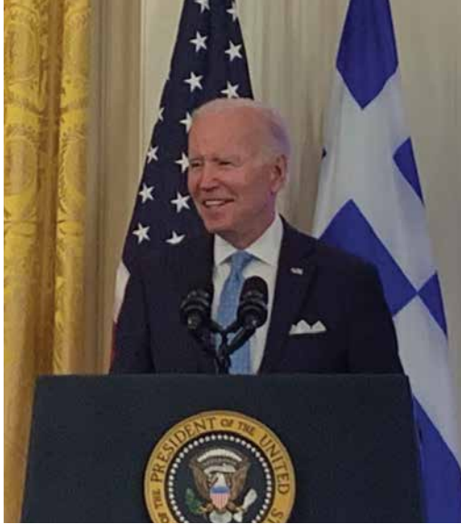
President Biden delivering remarks at White House.