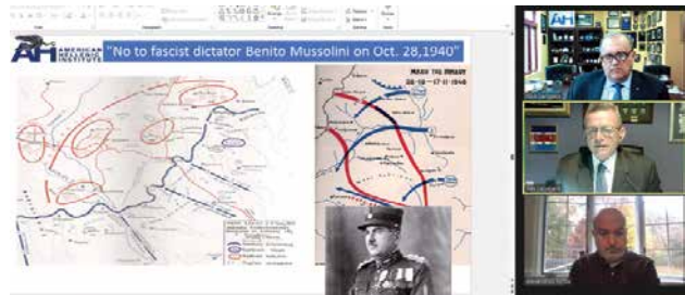
A slide from Lt. Gen. Leontaris' presentation.