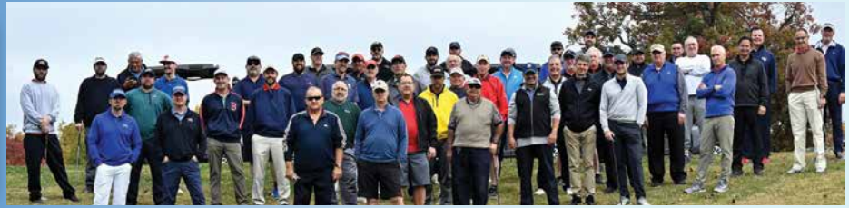
Group picture of the golfers before teeing off.