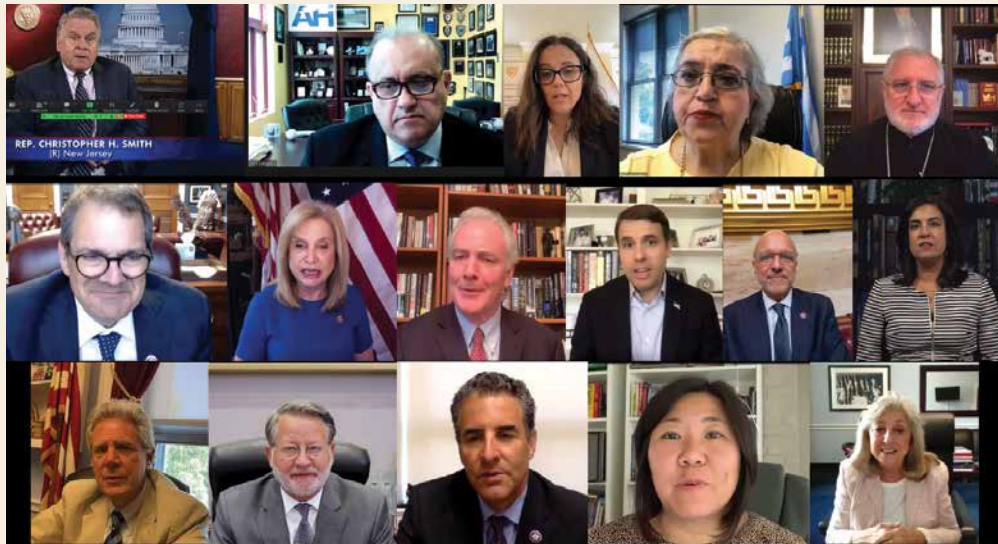
AHI virtually hosted an event with U.S. policymakers to commemorate the dark 48-year anniversary of Turkey's invasion of Cyprus

AHI virtually hosted an event with U.S. policymakers to commemorate the dark 48-year anniversary of Turkey's invasion of Cyprus, July 27, 2022. AHI hosted it in cooperation with the Congressional Hellenic Caucus's co-chairs, U.S. Reps. Gus Bilirakis (R-FL) and Carolyn Maloney (D-NY).