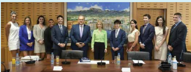
Meeting with the President of the House of Representatives Annita Demetriou