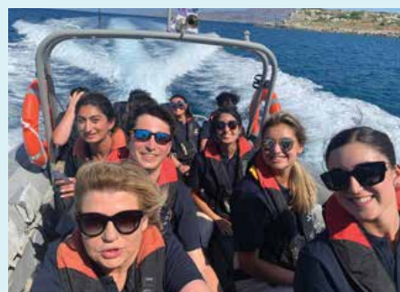
Students enjoying the opportunity to ride in a Greek naval speedboat in Souda Bay.